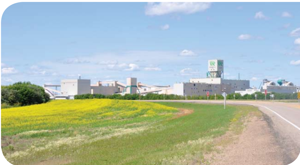
Potash mine near Saskatoon.

Water is an essential resource in the potash mining process. Potash mines in the Qu’Appelle River Watershed get their water from three sources: the Qu’Appelle River system itself (which includes the Buffalo Pound Lake reservoir), groundwater, or from Lake Diefenbaker via the Saskatoon South East Water Supply System (SSEWS). This case study research focuses on mines that do not source their water from the SSEWS, since the SSEWS is connected to the South Saskatchewan River Basin and is considered to be a different system in terms of water management. There are eight potash projects in the Qu’Appelle River Watershed that do not source their water from the SSEWS - four producing mines and four non-producing mines at various stages of development (Figure 2). Of these eight mines, six are covered in the interview sample (see Methods section).