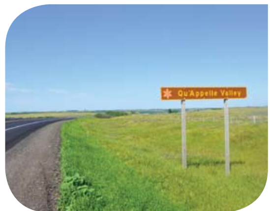
LEFT: Flooded road near Saskatoon. RIGHT: Entering the Qu-Appelle Valley.